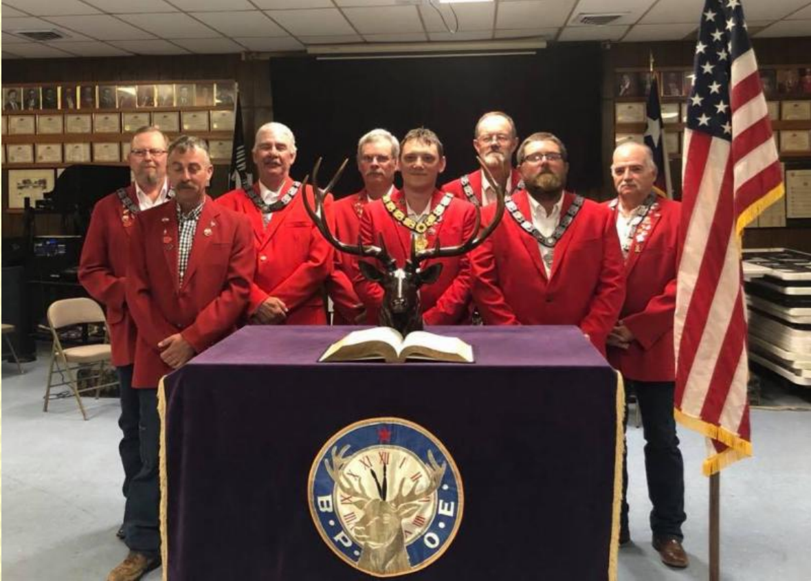
Beautiful flag day ceremony presented by the Borger Elks Lodge. Great job guys! "I believe our flag is more than just cloth and ink. It is a universally recognized symbol that stands for liberty, and freedom." — John Thune