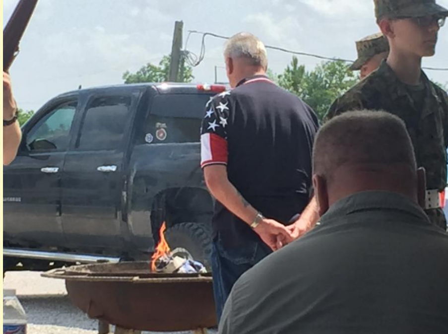
Beaumont Elks Lodge celebrated National Flag day on Sunday, June 3rd at 2:00 pm. The Navy JROTC of Central High School presented the flags and Boy Scouts Venture Crew conducted a Flag Retirement ceremony.